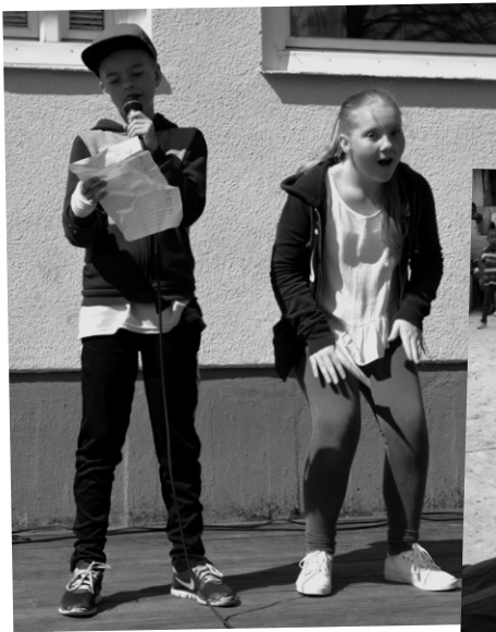
Do a role play of a press conference, or an inspiring speech about child rights!