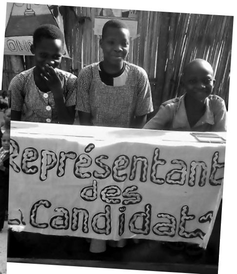
Do a role play as the Child Rights Heroes, or dramatise a scene from a child's life.