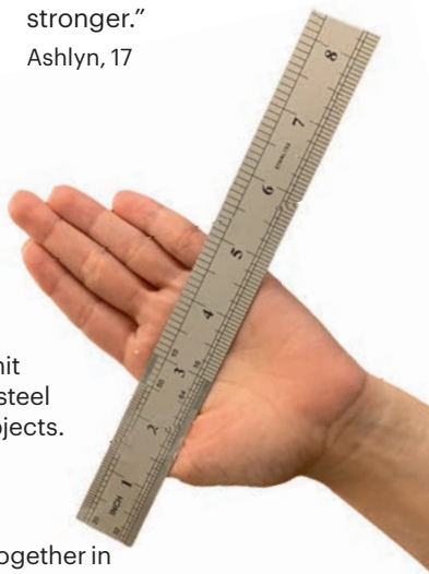
Many teachers hit students with a steel ruler or other objects.

The homes are very crowded together in Bonteheuwel, and many residents are poor.