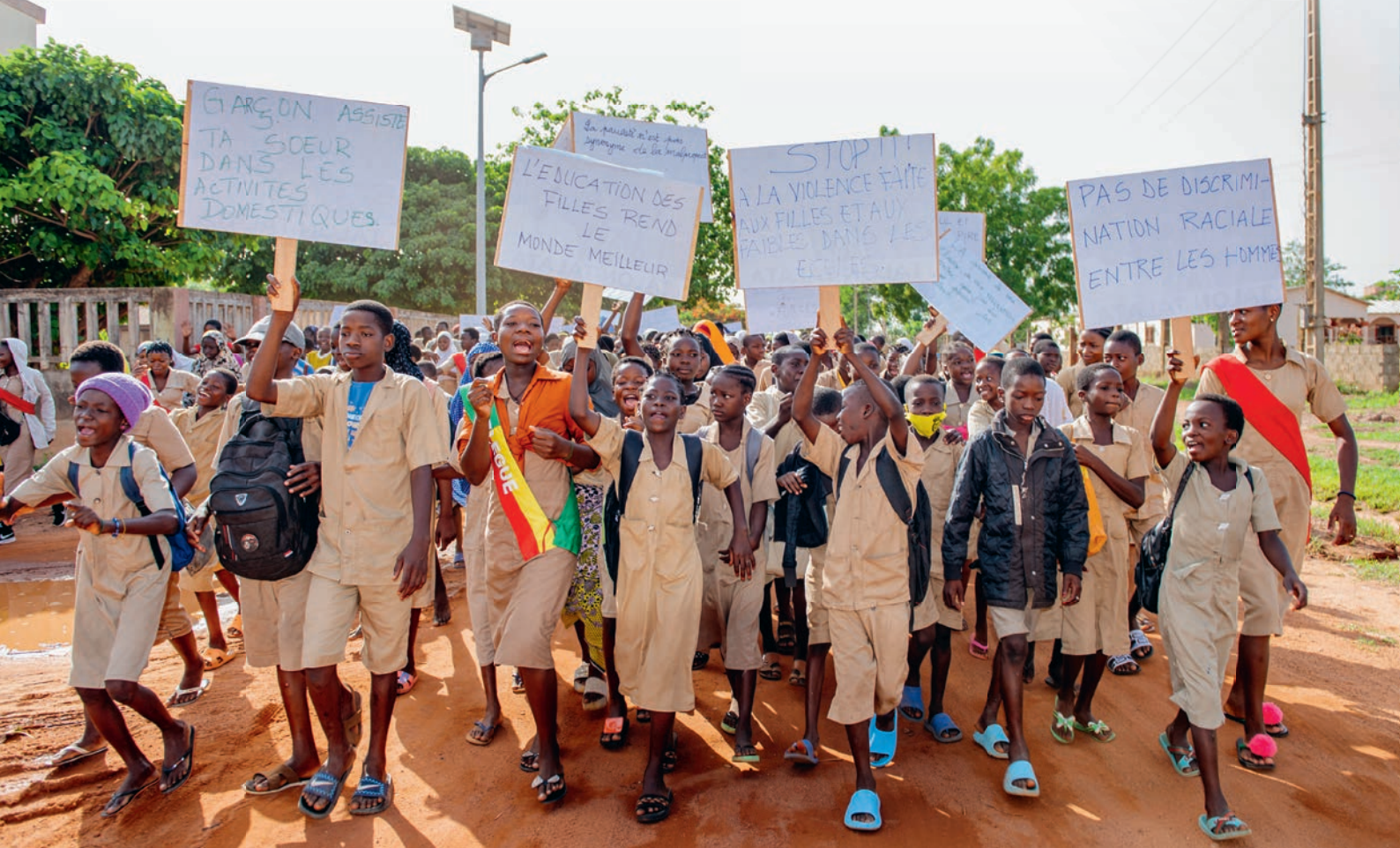
Students from Hubert Maga School in Parakou, Benin walked and danced their three kilometres accompanied by trumpets, drums and singing, with their signs demanding respect for various children's rights, including equal rights for girls.