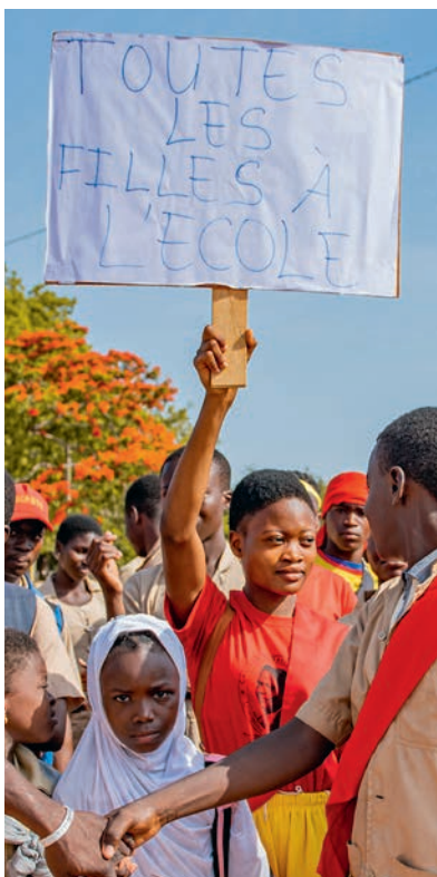
'All girls in school.'

Students in Parakou in Benin alternate between walking and dancing as they take part in the Round the Globe for Rights and Change event. Trumpets, drums and singing make it a fun three-kilometre walk for them.