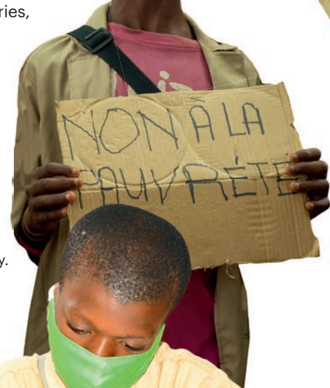
No to poverty.