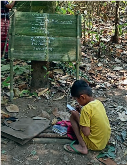
At the jungle school, their 'blackboard' is green and is made from large leaves. Here the children are learning the days of the week in English, but that means they also need to learn a different alphabet.