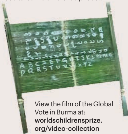
View the film of the Global Vote in Burma at: worldschildrensprize.org/video-collection