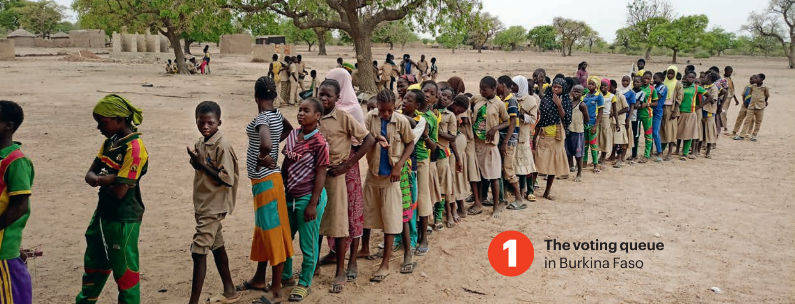
1 The voting queue in Burkina Faso