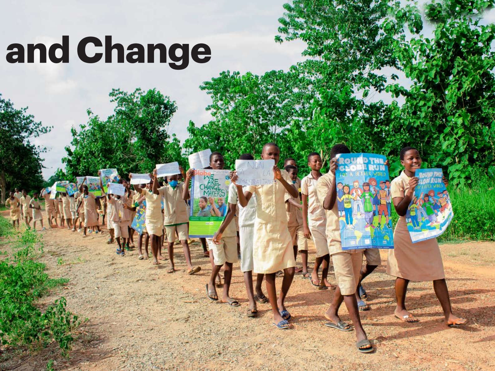
Students from Massi-Zogbodomé School in Benin walk their three kilometres with posters and signs demanding increased respect for children's rights.