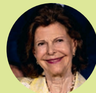
Queen Silvia of Sweden