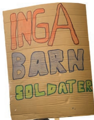
No child soldiers.