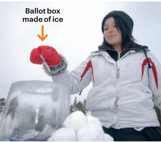
Ballot box made of ice