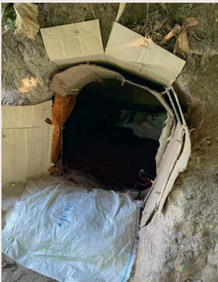
Protective trenches have been dug in the forest for the children to jump down into if the bombers come. But they have to be careful, as there may be snakes.