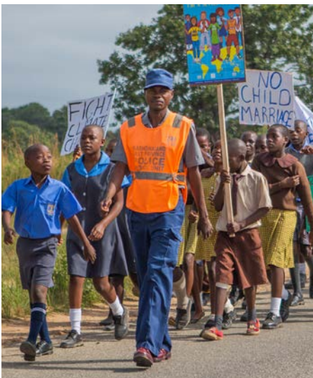
When the students from Hurungwe School in Zimbabwe complete their Round the Globe walk they go on main roads. So they asked the local police for assistance, and he stops all vehicles and makes them drive past slowly.