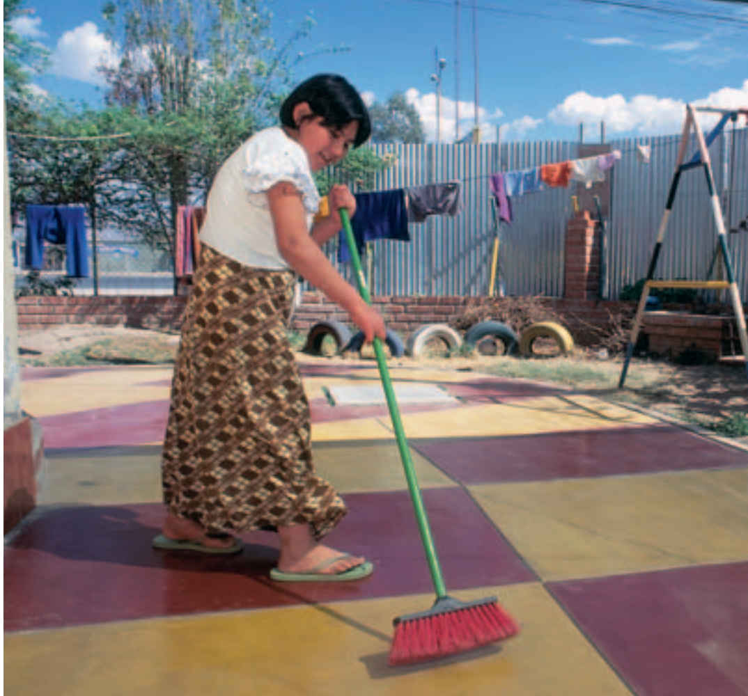
The girls are helping out at Rosa de Sarón.