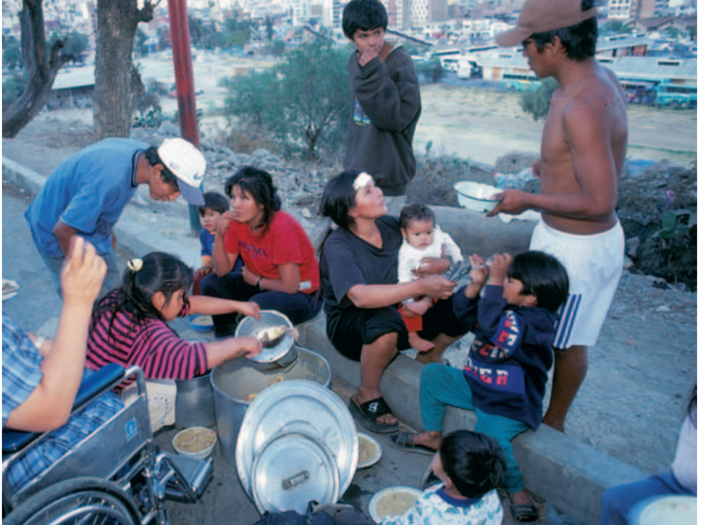
Many streetchildren both have parents who were streetchildren as well as they have their own children who live on the street.