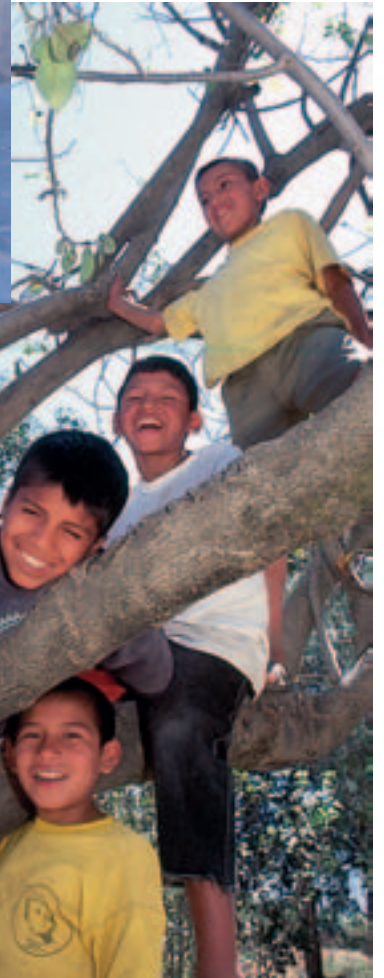
Some of the boys at El Arca.

street children refuse help. They don't want to give up their glue and the freedom of the street, despite all its horrors.