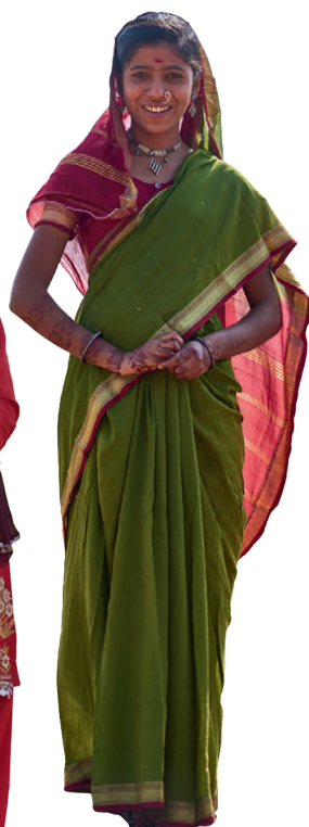
... and as Savitribai Phule.

“In India, girls are also subjected to harassment and sexual violence. Domestic abuse is also very common. But as more girls get to go to school and learn about their rights through Girls Clubs like ours, I believe things will change.