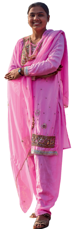
Independent and equal.

"The reason he thinks this is because I've always told him everything I learned about girls' rights in Ashok's Girls Club. Dad let me explain to him, and he has understood. I love him for that! The knowl-