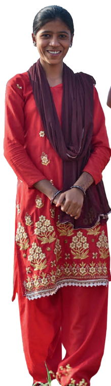
... peer educator ...