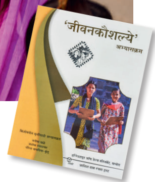
The book on Life Skills Education, which is so essential for these girls.

someone's wife and someone's mother, not to allow them to live their own lives.