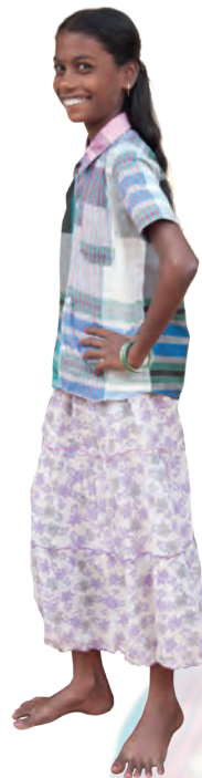
Play and housework