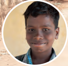
Thanga loves playing cricket. He also loves batting for equal rights for girls!