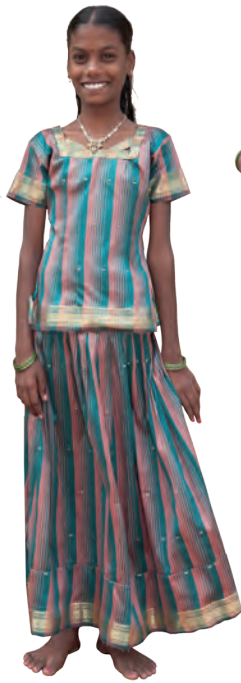
Ready to celebrate