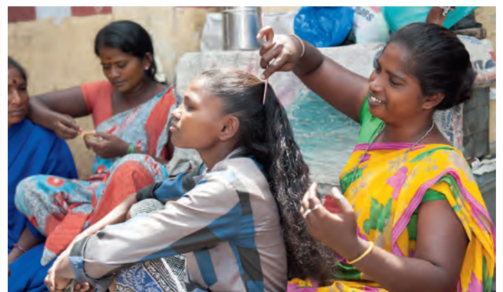
A mother checks her daughter for lice before school.