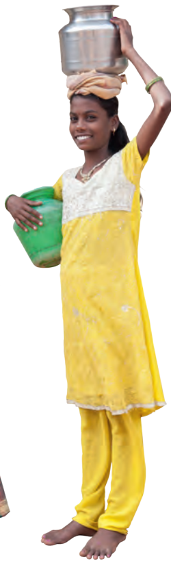
"Yellow makes me happy!"