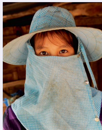
This work hat protects against dirt and dust!

"We have our own culture, language and clothes. These days I don't wear Hmong clothes all that often. Most of the young people prefer jeans and casual clothes for everyday wear. But to join in with our festivals you have to wear traditional clothes. My mother made my beautiful clothes. I really like getting dressed up!"