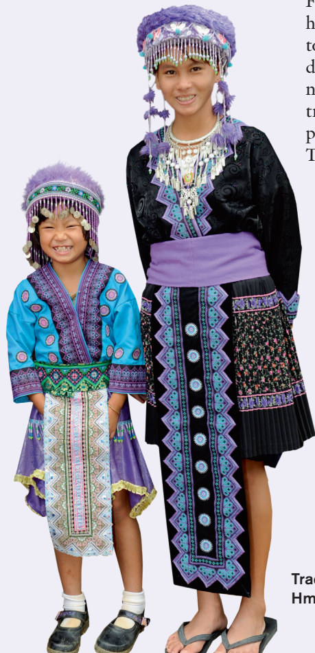
Traditional Hmong clothes.

It takes two hours to travel to the prison in town. They have to walk the last bit of the journey, past high white walls with barbed wire and broken glass along the top. There is a long queue outside the entrance to the prison and Fanta is surprised to see so