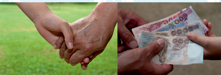
A lot of people everywhere make money from child trafficking.