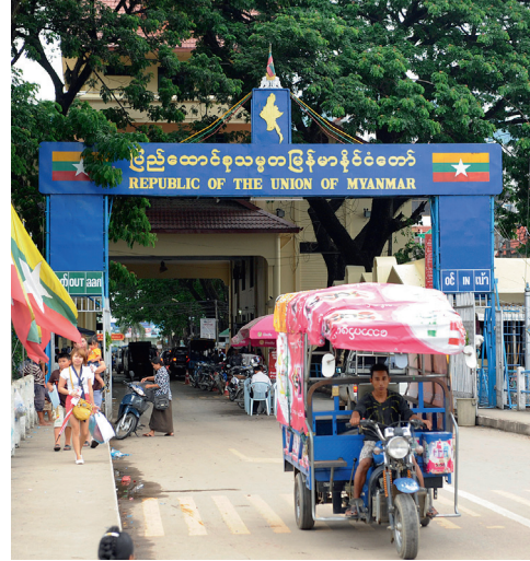
Many of the girls come from Burma (Myanmar).