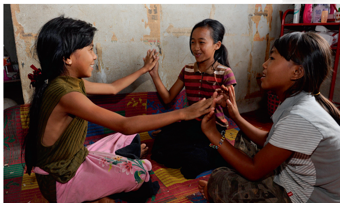
H, Apia and Amoko often play clapping games!