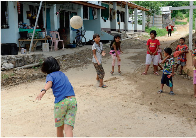
The girls in the village love to play ball games!