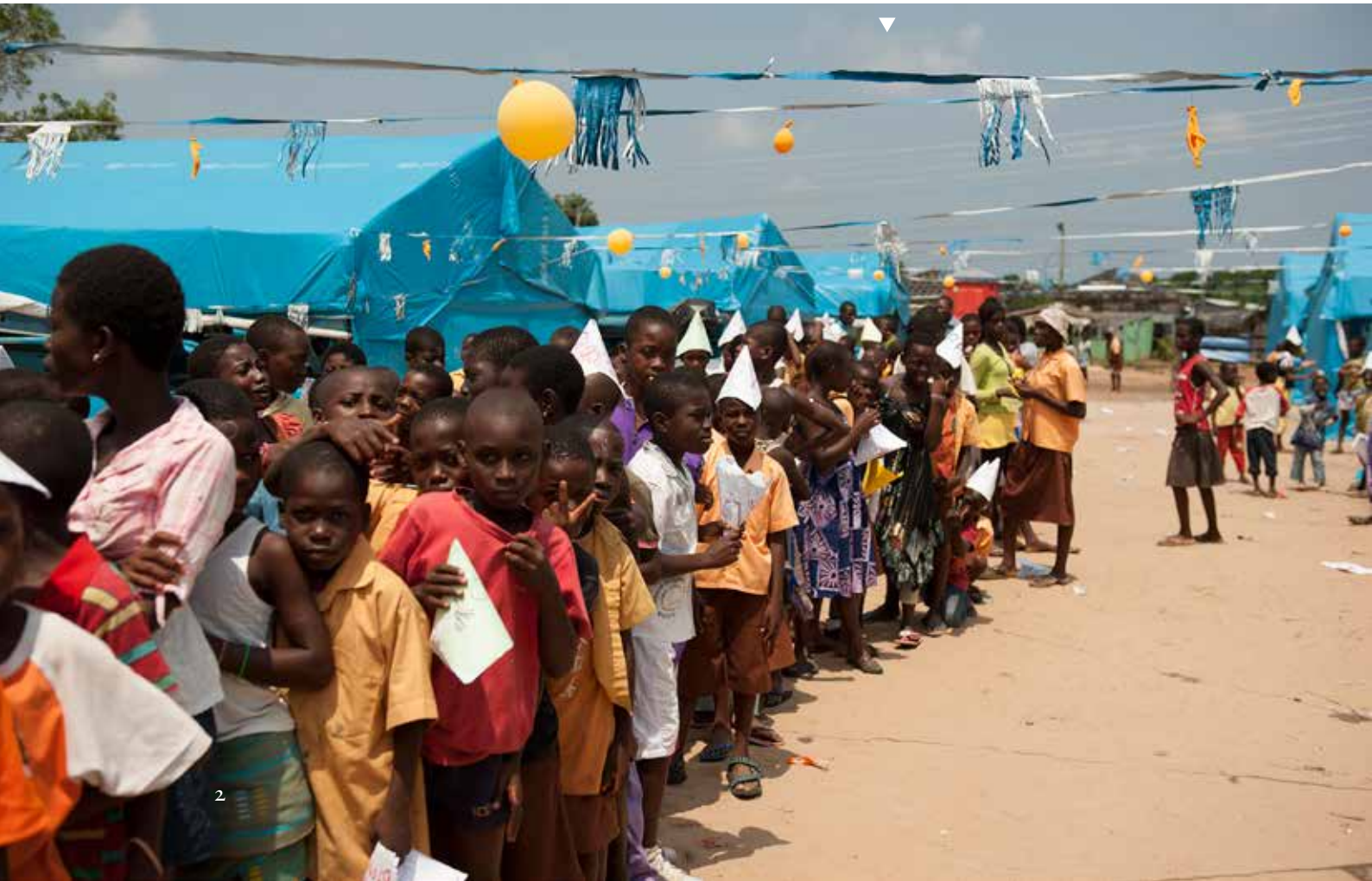
The voting queue on Global Vote Day stretches far into the refugee camp Ampain in Ghana, where many children have come to escape a bloody civil war in Ivory Coast.