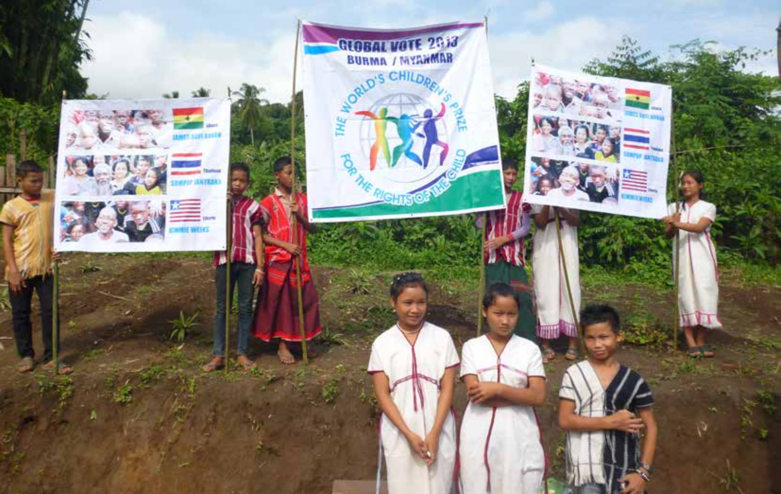
For many years the WCP magazine the Globe has been translated into Karen and smuggled into Burma/Myanmar. Children in the Karen Province have been given the possibility to learn about children's rights and to vote in a democratic election. Thus, these children from the Saw Bwe Dern school, are well prepared for the transition to democracy in their country.