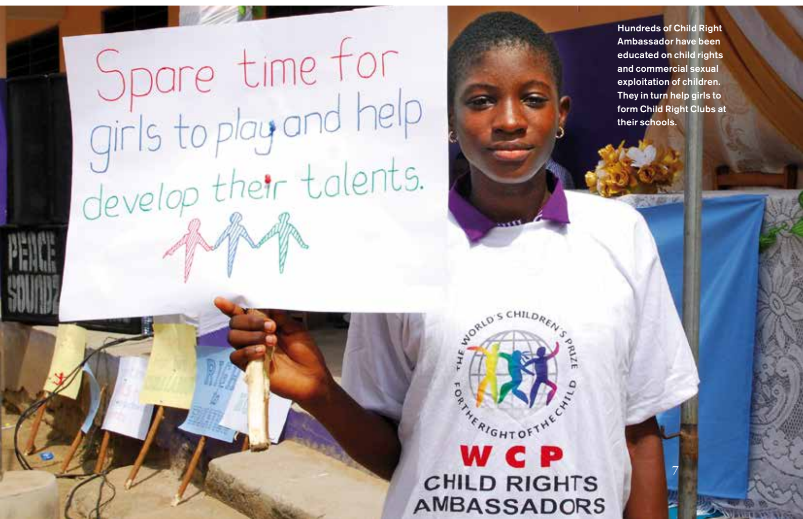
Hundreds of Child Right Ambassador have been educated on child rights and commercial sexual exploitation of children. They in turn help girls to form Child Right Clubs at their schools.

Figures are given in SEK unless otherwise stated.