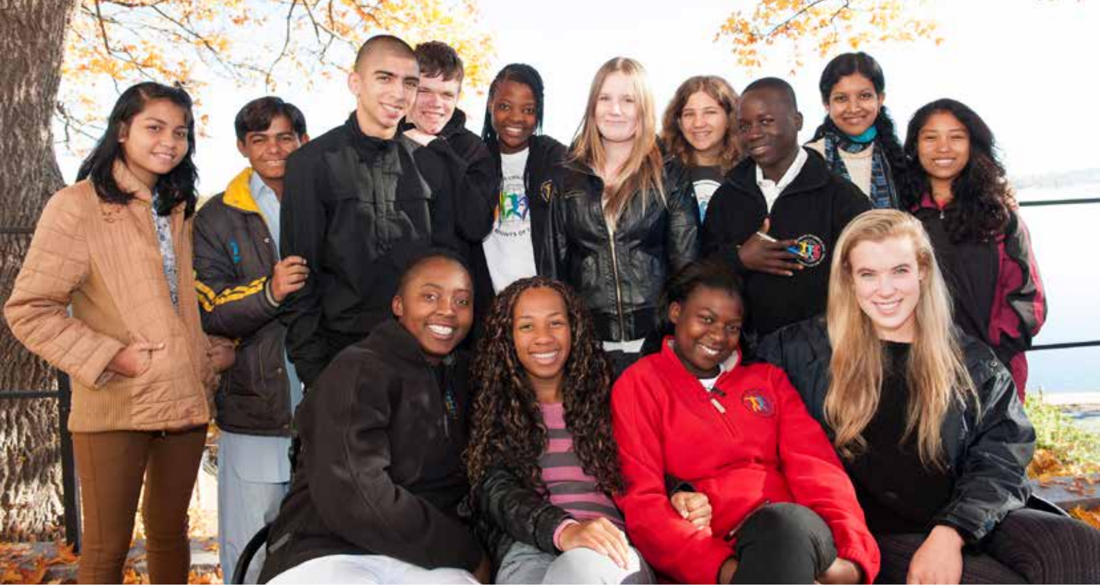
The World's Children's Prize Child Jury 2013.