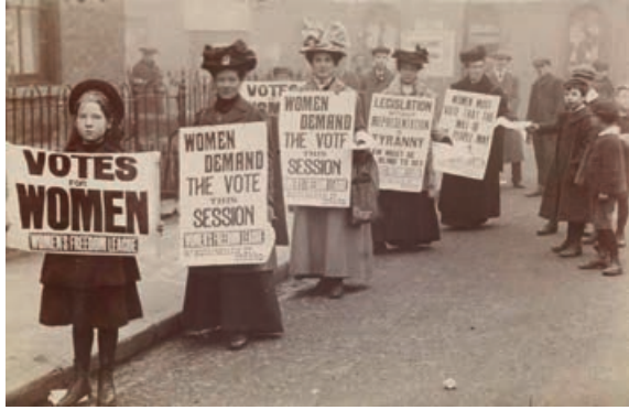
MUSEUM OF LONDON

In the late 1800s, more and more women were demanding the right to vote in political elections. In 1906, Finland was the first country in Europe to give women the vote. Sweden and the UK followed suit in 1921. In most of the other countries in Europe, Africa and Asia, women were not allowed to vote until 1945, or even later.