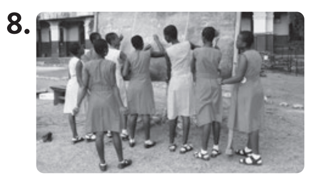
Count the votes and announce your result. Report the number of votes for each candidate to the WCP!