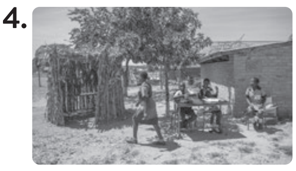
Walk to the voting booth.