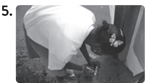
Step into the voting booth alone, mark the ballot paper and fold it before stepping out.