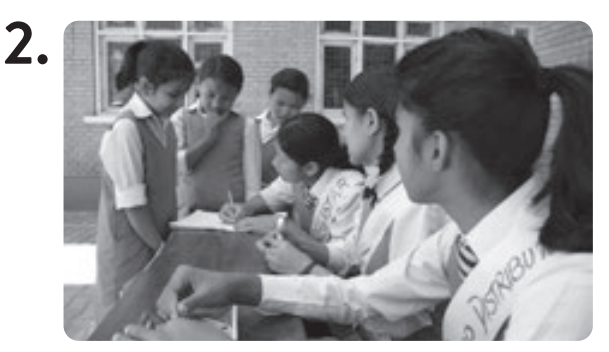
First in line steps up to meet the voting officials.