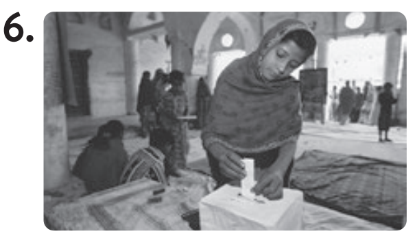
Place the folded ballot paper in the ballot box. Voting completed!