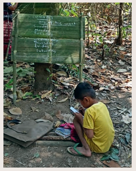
At the jungle school, their 'blackboard' is green and is made from large leaves. Here the children are learning the days of the week in English, but that means they also need to learn a different alphabet.