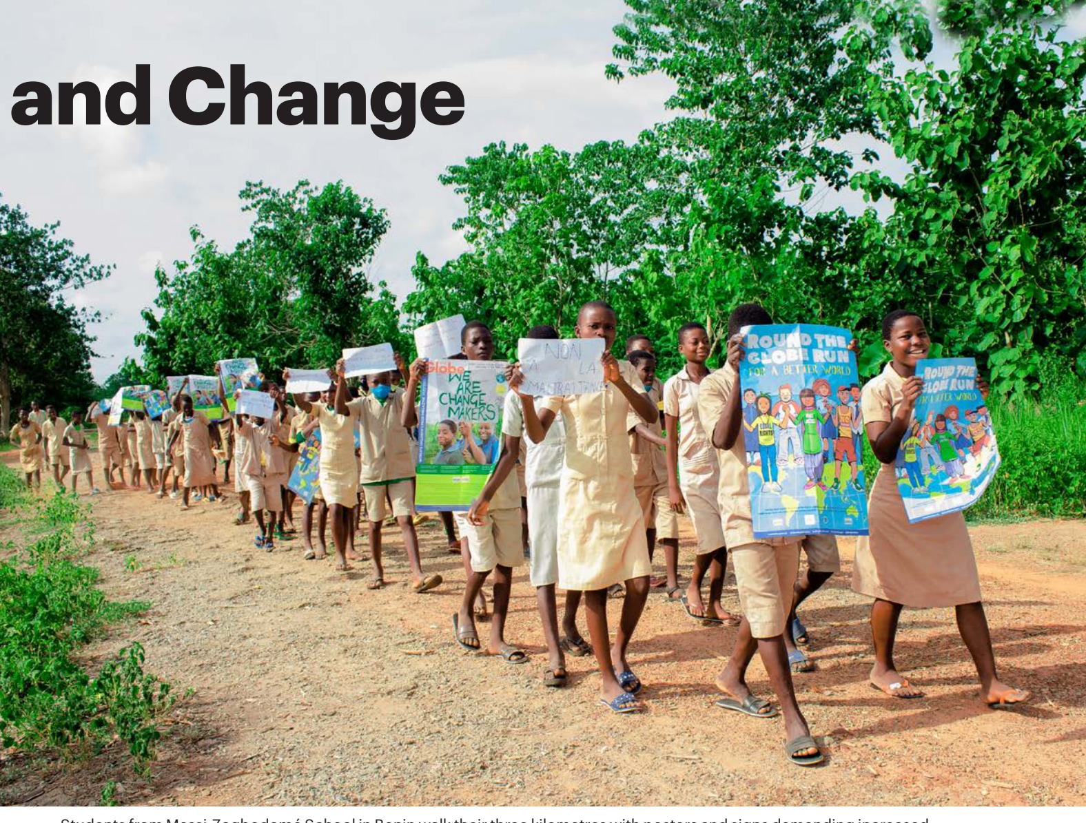
Students from Massi-Zogbodomé School in Benin walk their three kilometres with posters and signs demanding increased respect for children's rights.