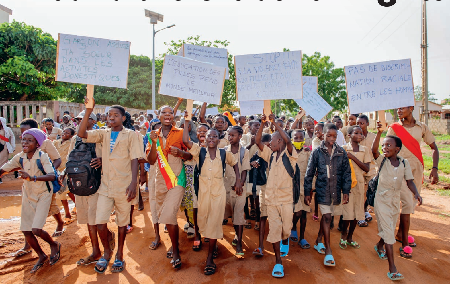
Students from Hubert Maga School in Parakou, Benin walked and danced their three kilometres accompanied by trumpets, drums and singing, with their signs demanding respect for various children's rights, including equal rights for girls.