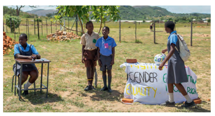
Once their votes for the Child Rights Hero and children's rights have been put in the ballot box, one of their nails is coloured with a marker pen to prevent cheating.