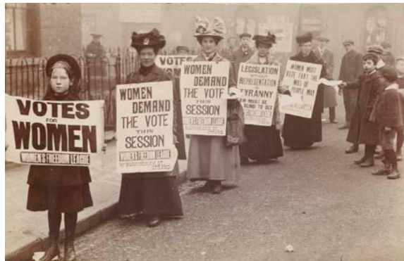
MUSEUM OF LONDON