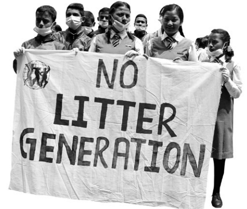
Children in Nepal organizing a No Litter Day.

On 14 May or any day that week, children in your school and around the world organize their own No Litter Day. They show that they are part of a No Litter Generation , and collect litter in their communities. At the same time they share information about the right of all children to live in a clean and healthy environment, and the need to stop climate change.